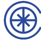
Metadata Query Service